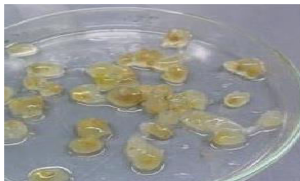
Fig- 2: Artificial seeds encapsulated by sodium alginate (2% sodium alginate)

Small gel beads were obtained when small pieces of callus culture were coated with 3% and 2% sodium alginate and then treated with \text{CaCl}_2 \cdot 2\text{H}_2\text{O} solution. Freshly encapsulated seeds obtained appeared elastic to the touch and showed a transparent gel layer of 2-4 mm at 3% sodium alginate (Figure 1) whereas at 2% sodium alginate seeds were malformed, too soft to handle and very fragile (Figure 2).